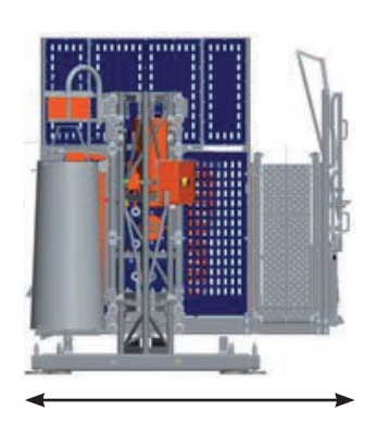
Max dimension rotated up 2320 (< 2400)

The design of TPL 2000 D is made in order to be transported fully assembled in a truck 2.4 m (7'10") wide