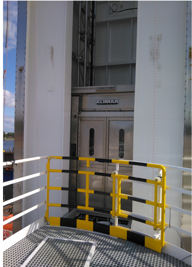
The Alimak elevator on the VOS Start vessel has a variable top landing to provide stepless access during offshore service projects.

The operation of an Alimak rack and pinion elevator is not affected by rolls, pitches or heaves and the design is well suited for marine environments. These benefits and the narrow installation profile makes the Alimak marine elevator suitable for these conditions. Designed for the toughest environments on the planet, Alimak marine elevators have an expected life of 30 years at minimum with regular maintenance.