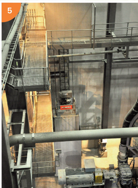
Flotation Elevator: ALIMAK SE 1000 FC Capacity: 1000 kg Lifting height: 20 m