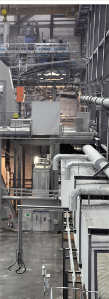
E 1800 FC