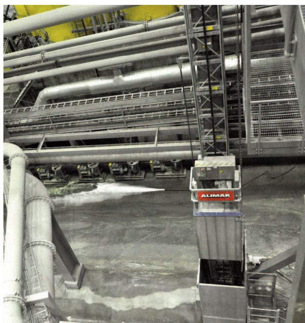
One out of the seven Alimak rack and pinion elevators working at the Aitik copper mine.

meters. The deepest situated Alimak elevator is for the Sudbury Neutrino Observatory in Canada, about 2,000 meters below ground level.