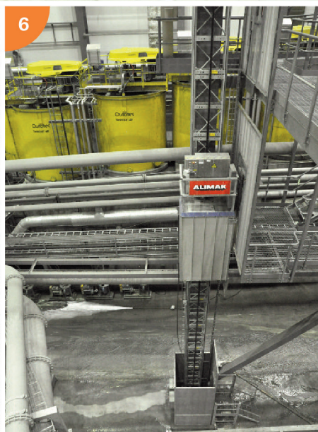
Flotation Elevator: ALIMAK SE 400 FC Capacity: 400 kg Lifting height: 14 m