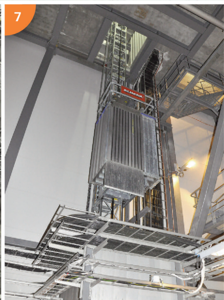
De-watering Elevator: ALIMAK SE 1000 FC Capacity: 1000 kg Lifting height: 18 m