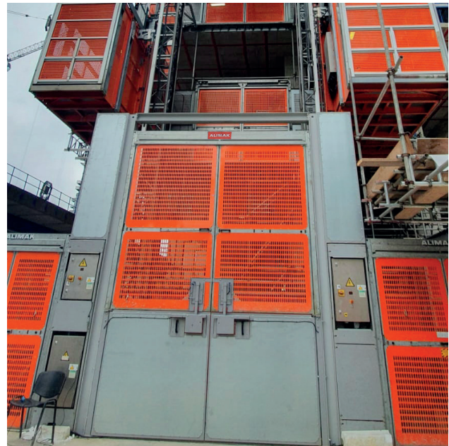
The bespoke Mammoth gate. Picture shows the gate leaf steel extension which increases gate from 2.8m to 4.2m.