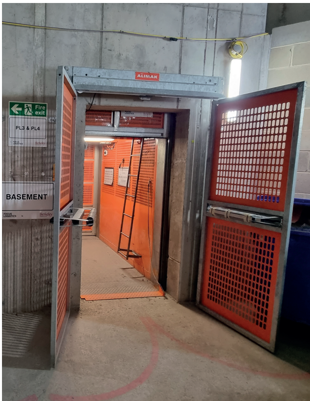
One of the Scando 450 FC hoists, installed in a lift shaft.

South Quay Plaza 4 is a Berkeley Group development and has been designed by Foster+Partners. When complete it will be 58 storeys high, incorporating both residential and retail units, as well as a communal terrace and sky garden.