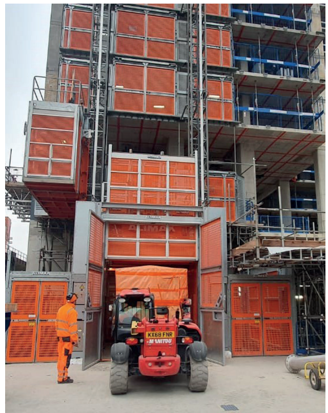
Unloading straight into the Alimak Mammoth hoist made easy by the hoist floor being level with the site floor.